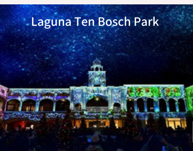
Laguna Ten Bosch Park