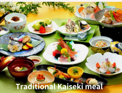
Traditional Kaiseki meal