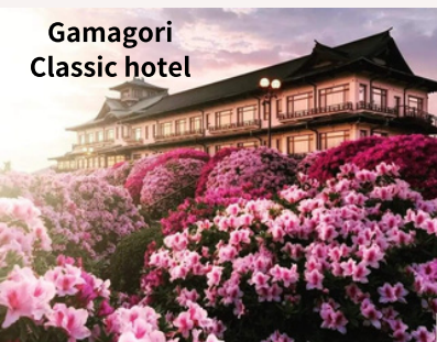
Gamagori Classic hotel