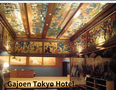
Gajoen Tokyo Hotel